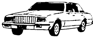
A two-ton car

What puts greater force on a hardwood floor?